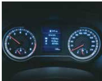
8.89 cm (3.5") speedometer with multi info display