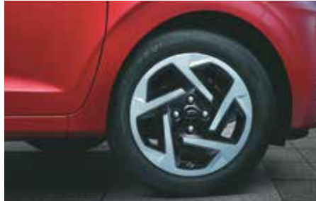
R15 (D = 380.2mm) Dual tone styled steel wheel