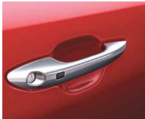
Chrome outside door handles