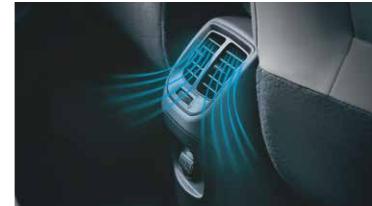
Rear AC vent