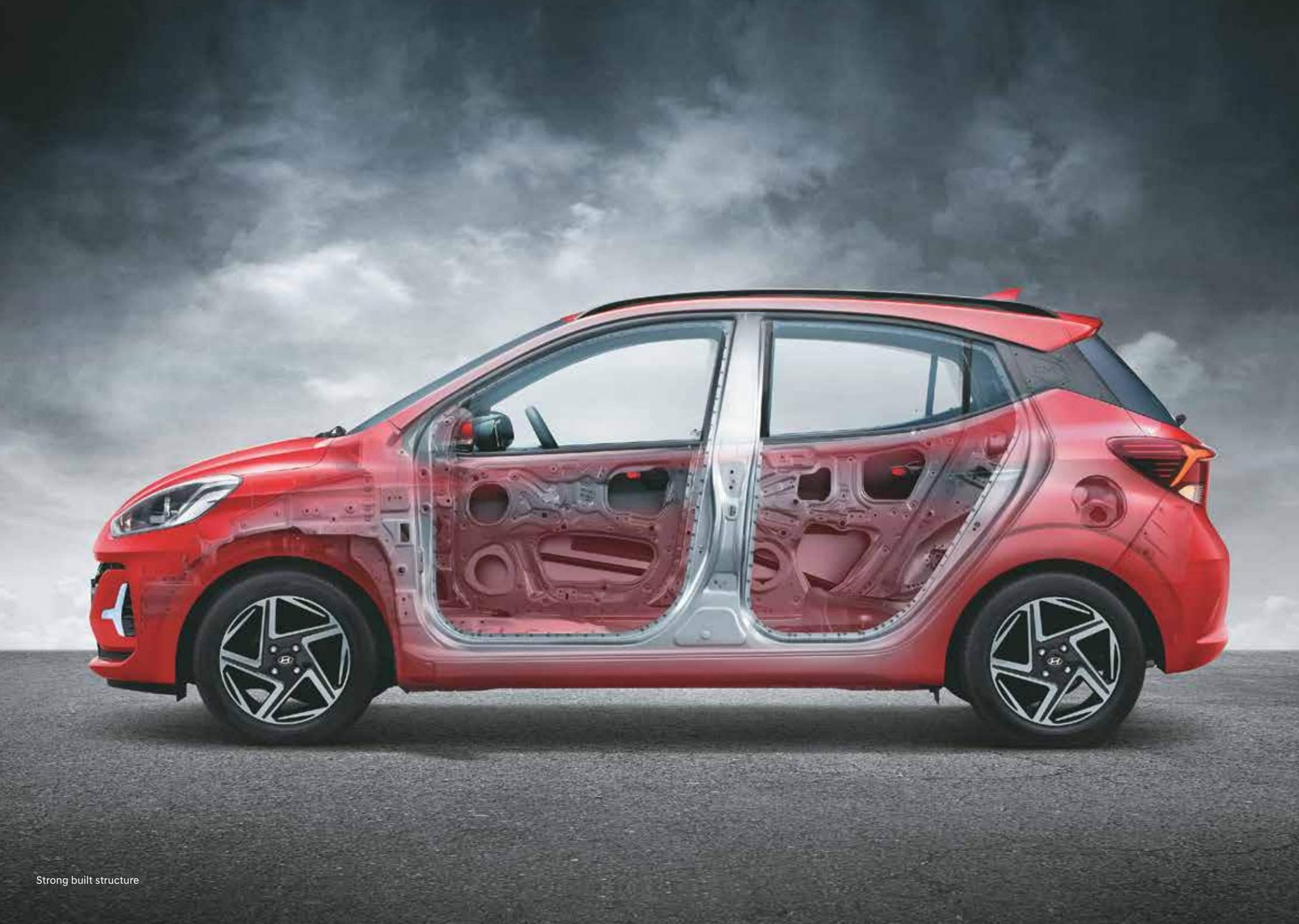
Strong built structure