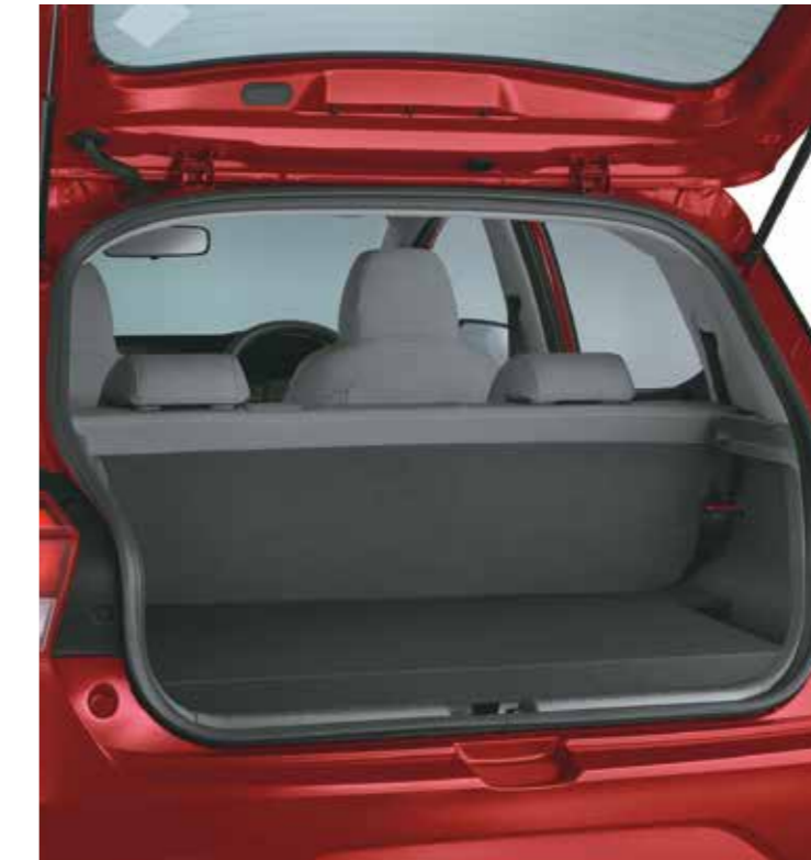
Spacious boot with company-fitted dual cylinder CNG

Hyundai Grand i10 NIOS Hy-CNG duo is engineered to optimize every journey. Equipped with a dual-cylinder system, it offers more boot space and fuel efficiency. It ensures you have all the room you need for your adventures while delivering exceptional performance.