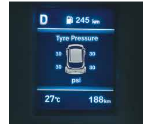
Tyre pressure monitoring system (TPMS) - highline