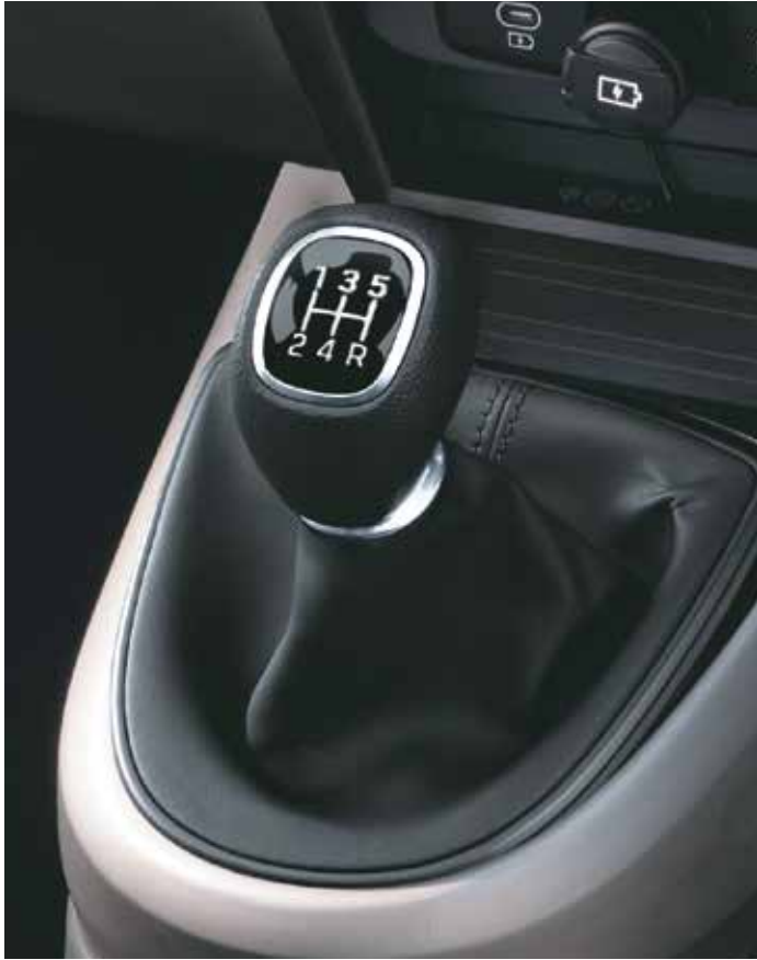
Manual transmission (MT)