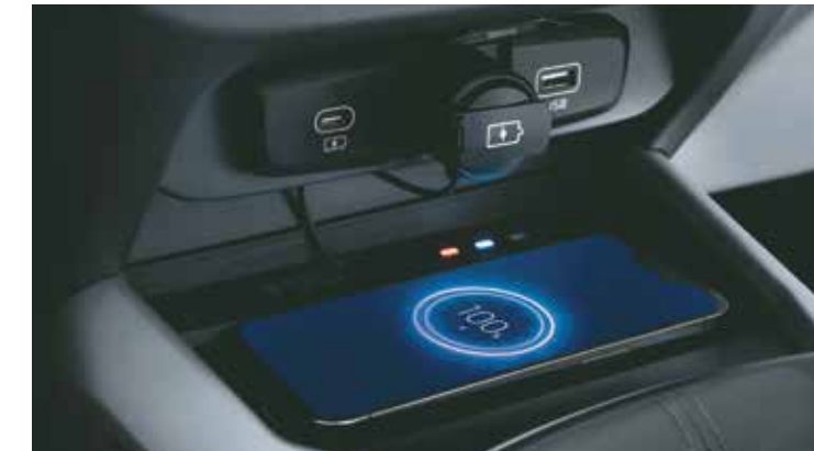
Wireless phone charger*

Modern well appointed interiors and refreshing layout makes the Grand i10 NIOS stand out. Stylish upholstery and superior fit & finish combined with spacious cabin make long drives a pleasurable experience.