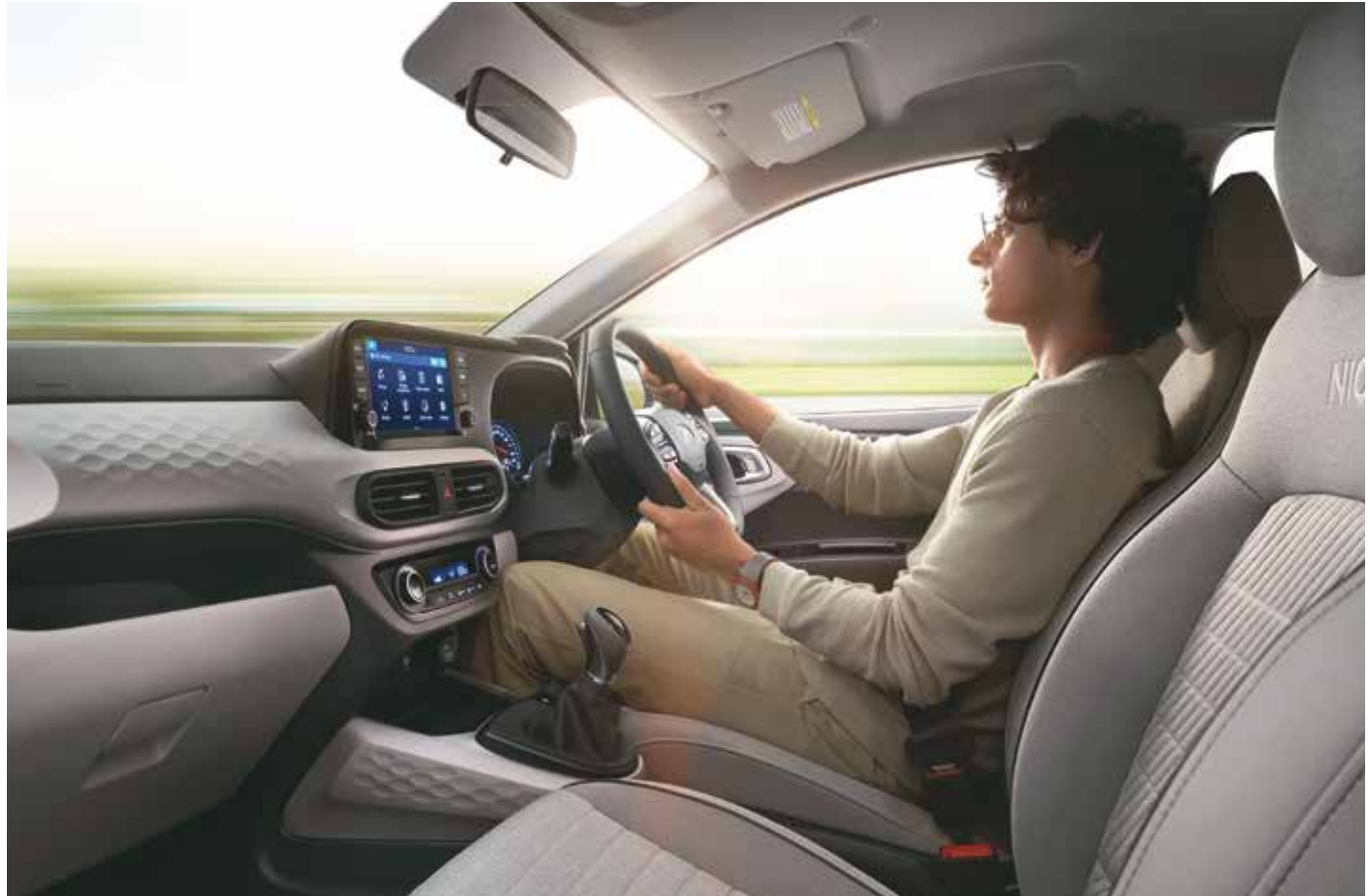
Dual tone grey interior

Other features: Steering mounted audio & bluetooth controls