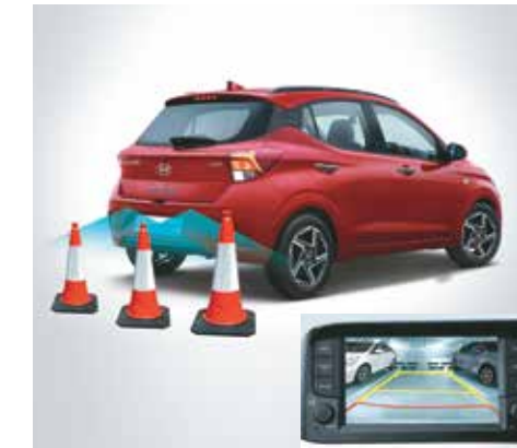
Rear parking camera with display on audio