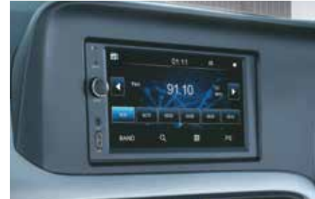
17.14cm (6.75") touchscreen display audio

Other features: 3 Point seat belts (All seats) | Seat belt reminder (All seats) | Headlamp escort system Burglar alarm | TPMS - highline | 6 Airbags