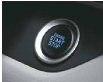
Smart key with push button start/stop