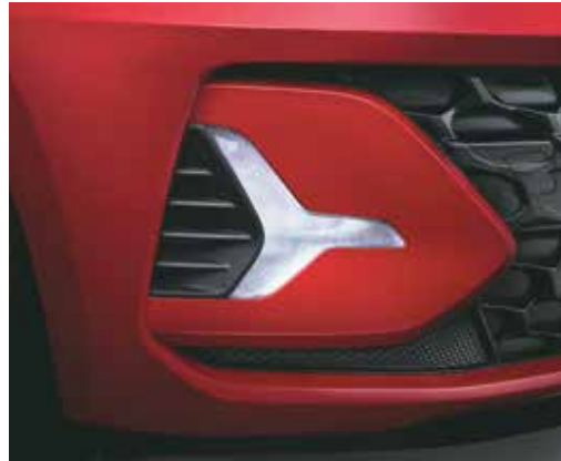
LED daytime running lamps (DRLs)