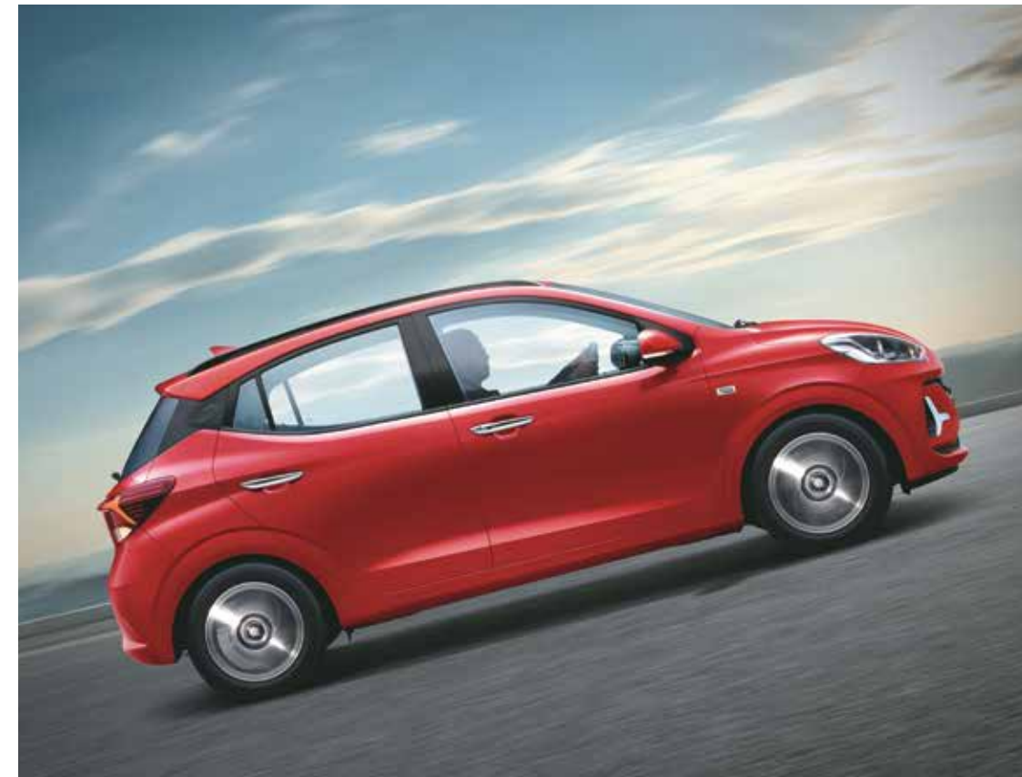
Hill-start assist control (HAC)