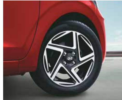
R15 (D=380.2 mm) diamond cut alloy wheels