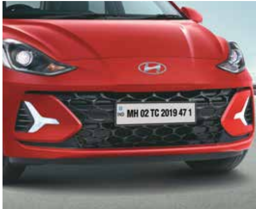
Painted black radiator grille

Style meets sophistication in the Grand i10 NIOS. The painted black radiator grille and LED daytime running lamps (DRLs) give it that refreshing look. The R15 (D=380.2 mm) diamond cut alloy wheels project an agile stance. And the tail gate design with LED tail lamps defines its sharp rear profile, giving the Grand i10 NIOS an unique identity.