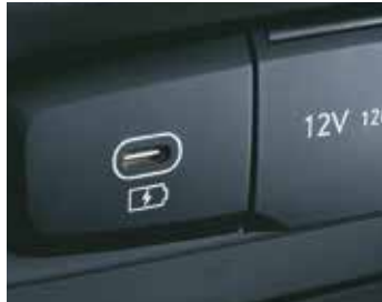
Fast USB charger (Type C)