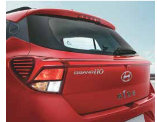
LED tail lamps