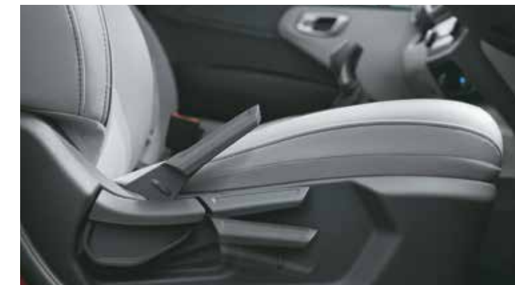
Driver seat height adjuster