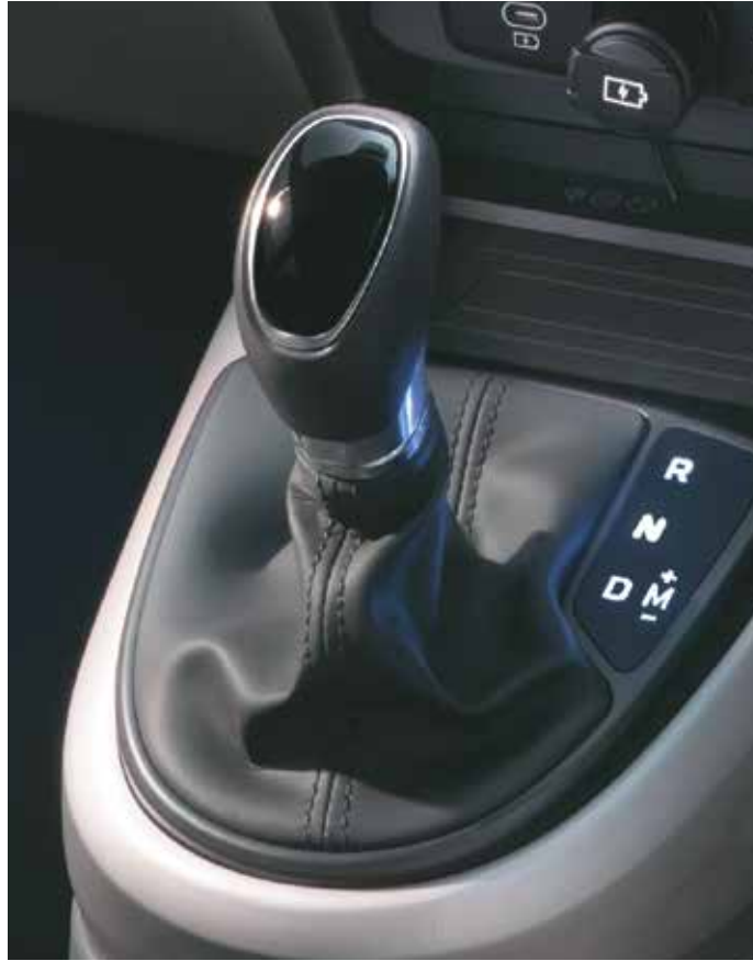
Automated manual transmission (AMT)