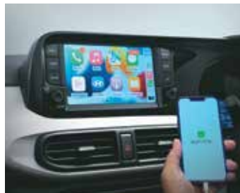
Apple CarPlay and Android Auto