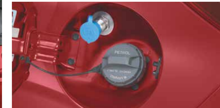
Convenient CNG filling with fast refuelling nozzle (near petrol filling area)