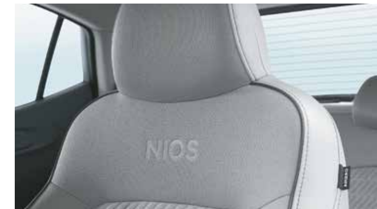
Semi fabric seat with piping