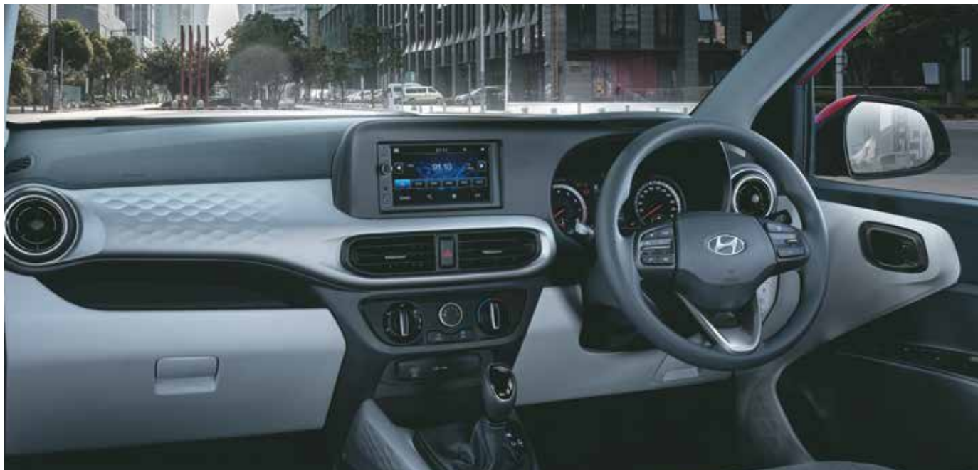
Dual tone grey interiors

Take control of your commute with the Grand i10 Nios corporate trim. Meticulously crafted to enhance your drive while exuding an executive presence. Experience the convergence of technology and design that features a monochromatic black interior punctuated by strategically placed red accents, and gleaming chrome details.